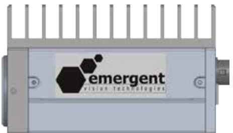
Side View Dimensions