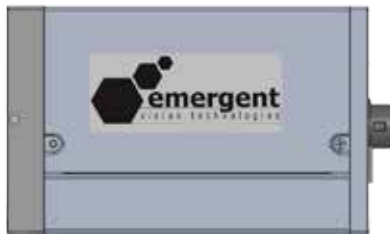
Side View Dimensions